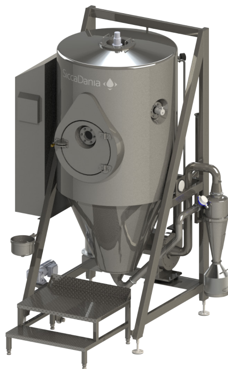
WATER EVAPORATION CAPACITY

SD900 is targeted for R&D work as well as small scale production and used by companies and universities worldwide. It is available in a standard version and also features a range of optional items and modules, thus enabling customization to match individual requirements. The SD900 is produced in sanitary design following GMP guidelines and includes state-of-the-art solutions regarding safety, easy cleaning and a sophisticated PLC based control system. All parts in contact with product are made in stainless steel and all elastomers are food grade approved. All plants are skid-mounted, FAT-tested and pre-wired which minimize installation time and costs.