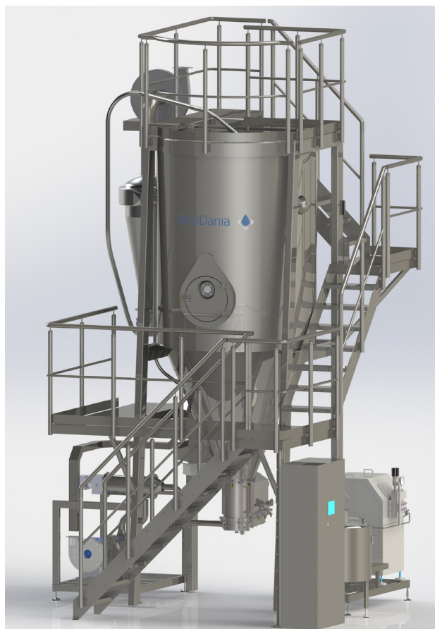
WATER EVAPORATION CAPACITY

SD1600 is targeted for R&D work as well as small scale production and used by companies and universities worldwide. It is available in a standard version and also features a range of optional items and modules, thus enabling customization to match individual requirements. The SD1600 is produced in sanitary design following GMP guidelines and includes state-of-the-art solutions regarding safety, easy cleaning and a sophisticated PLC based control system. All parts in contact with product are made in stainless steel and all elastomers are food grade approved. All plants are skid-mounted, FAT-tested and pre-wired which minimize installation time and costs.